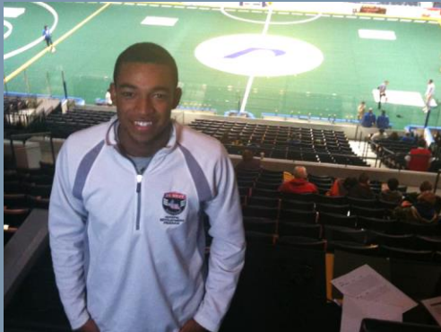
CGFHS Internship with Rochester Rhinos

Opportunities are available within Finney or with an enterprise within the community.